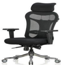
3. Revolving high back mesh senior exe.chair with cushion