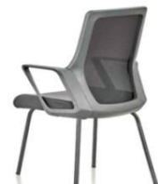
7. Reception Visitor Chairs