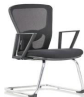
4. Visitors chair