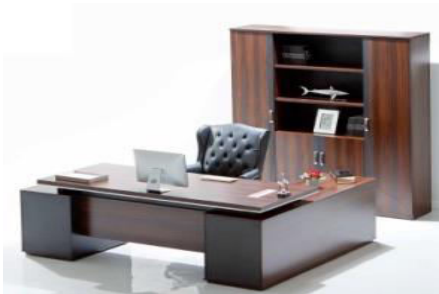
1. Executive table (Senate table without backstorage)