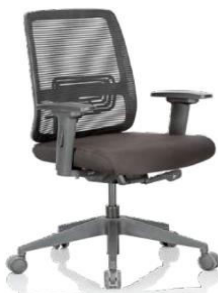
6. Revolving medium back mesh executive chair