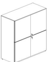
8. Edge side Storage