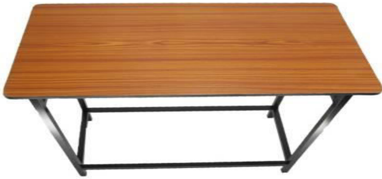
5. Steel Table