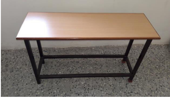
1. Tailoring Stool