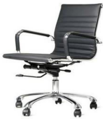
3. Revolving chair for Conference table