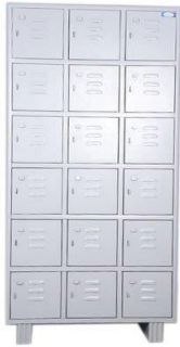
7. Locker Cupboard