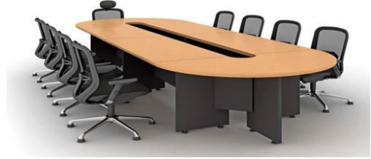
2. Conference table