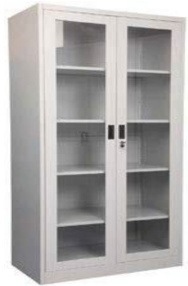
6. Cupboard with Glass door